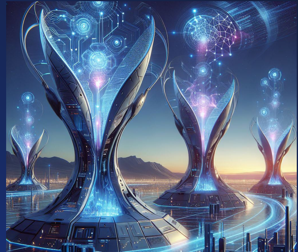
AI generated image

This call is launched for the selection of hosting entities of new AI EuroHPC supercomputers or for upgraded AI EuroHPC supercomputers, and the establishment of associated AI Factories.